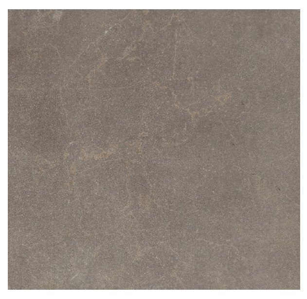
Fumo SP216 Fumo SM-SP216