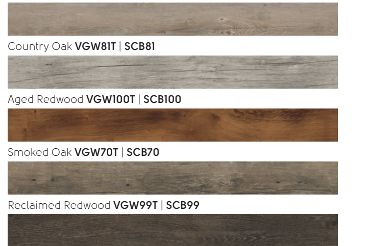
Tawny Oak VGW9IT | SCB9I