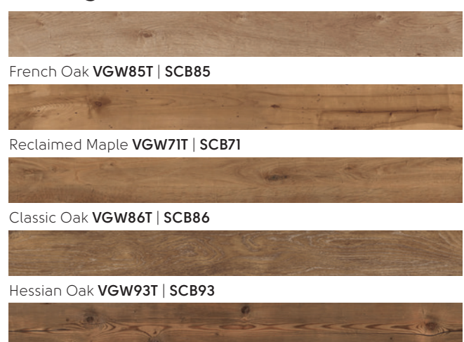
Vintage Pine VGW76T | SCB76