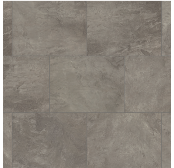
Coastal Fog RKT3004-G