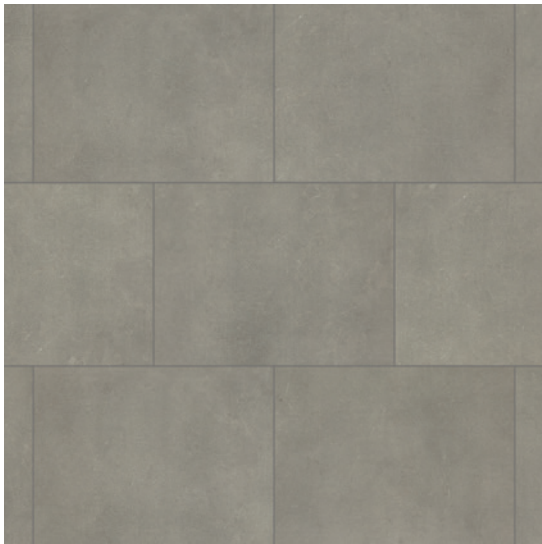
Metro Grey RKT3007-G