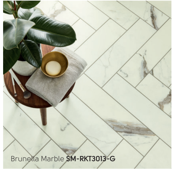
Brunella Marble SM-RKT3013-G