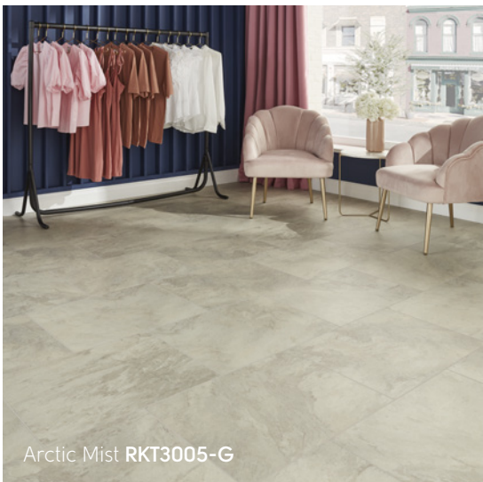
Arctic Mist RKT3005-G