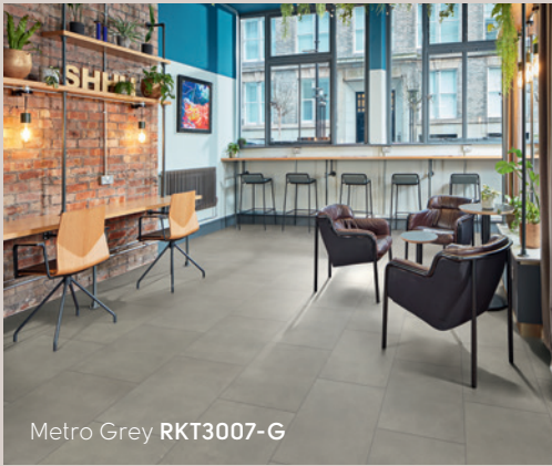
Metro Grey RKT3007-G