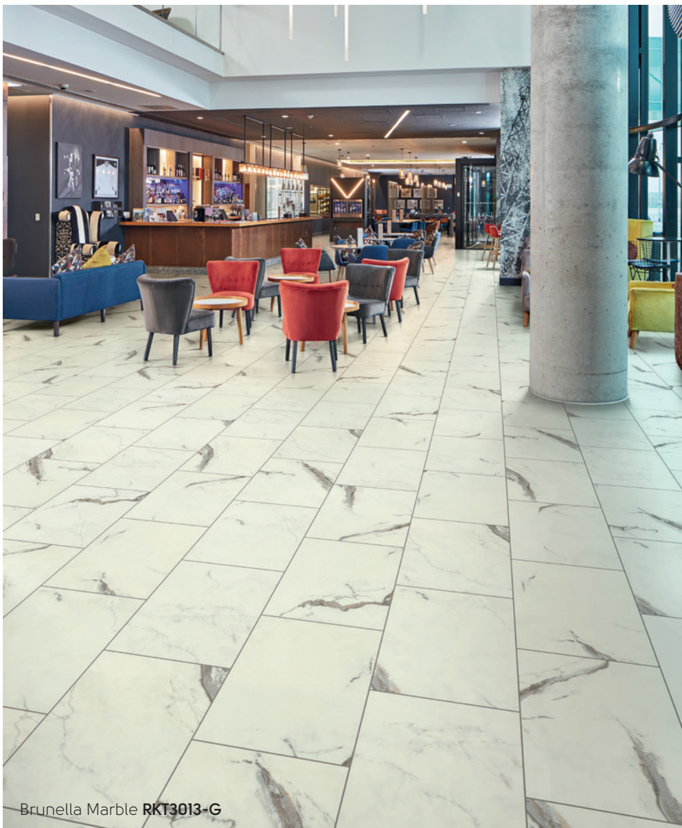
Brunella Marble RKT3013-G