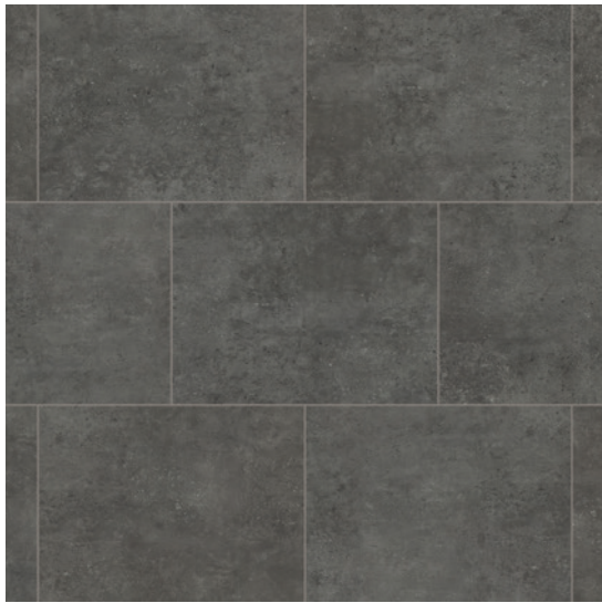
Oxford Grey RKT3008-G