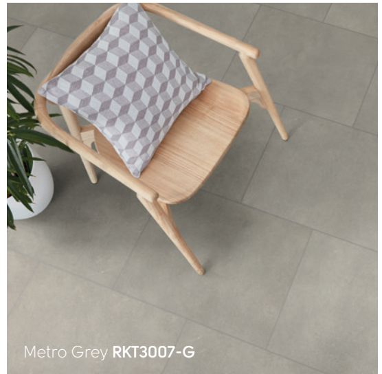
Metro Grey RKT3007-G