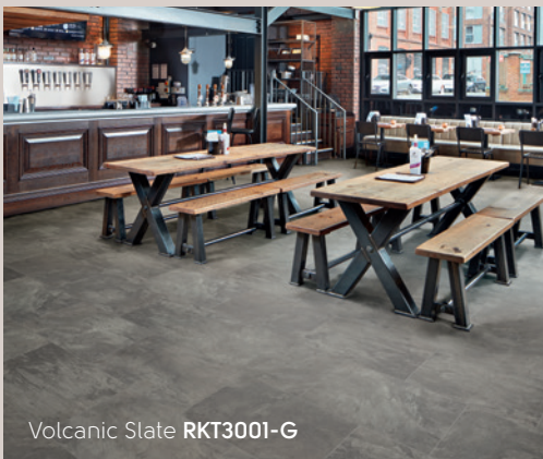
Volcanic Slate RKT3001-G

With the intent of creating a neutral, understated stone design, we looked to limestone as a source canvas. After lightly sandblasting grey English limestone to expose the face, it was acid-etched and evenly coloured before undergoing a “satino” process to add a smooth, satin-like feel to the product.