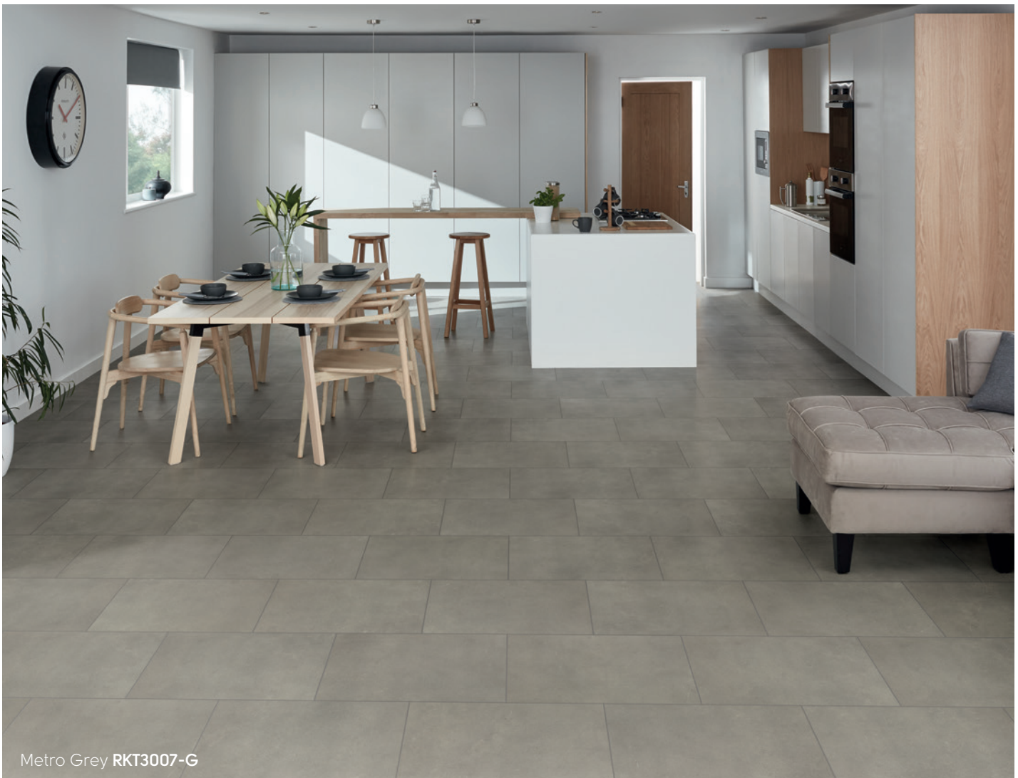
Metro Grey RKT3007-G