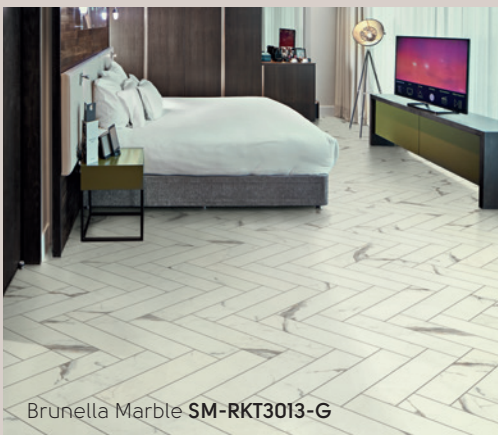
Brunella Marble SM-RKT3013-G

Unlike the bold, earthen-baked look of Spanish adobe cotta, our cotta design was inspired from reclaimed cotta found in this Northern European region. The understated character of these faded and more neutral tiles will instantly add history to your projects.