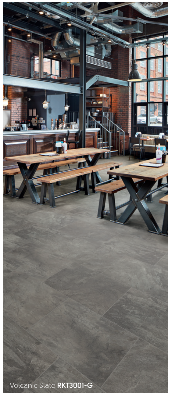
Volcanic Slate RKT3001-G