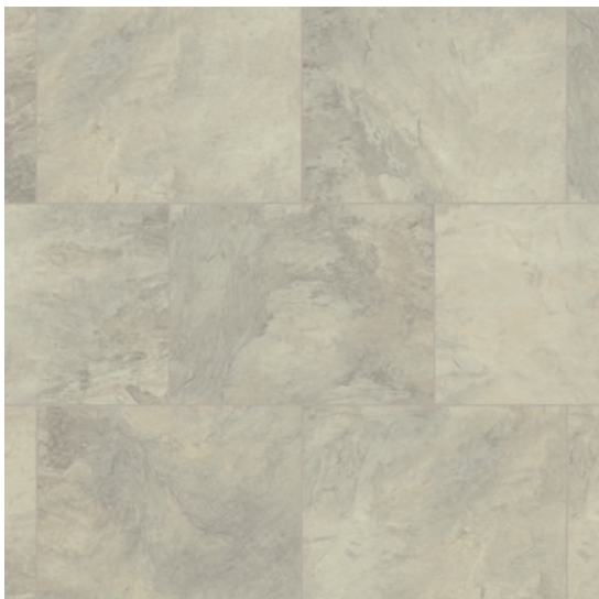
Arctic Mist RKT3005-G