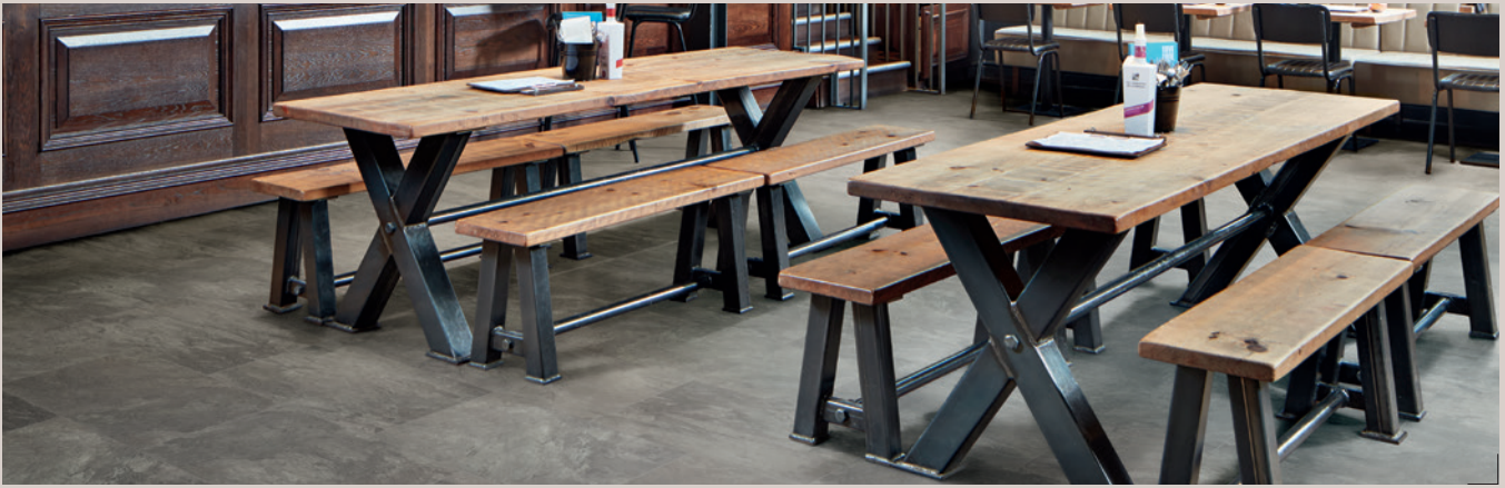
Volcanic Slate RKT3001-G

Korlok with InteGrout™ is the premier rigid core locking floor to hide subfloor imperfections and features a number of elements that help both the speed and ease of install - perfect for projects that need completing quickly.