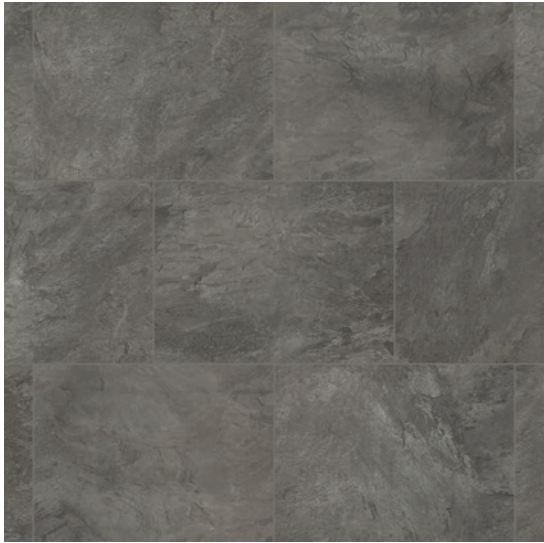
Volcanic Slate RKT3001-G