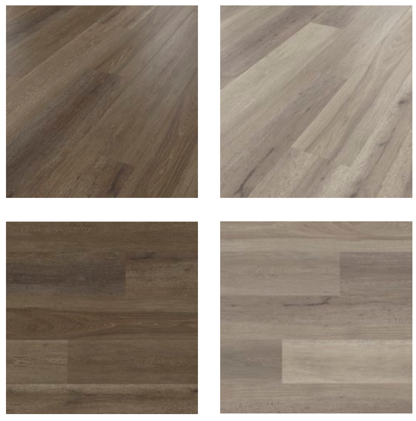
Washed Velvet Ash RKP8102