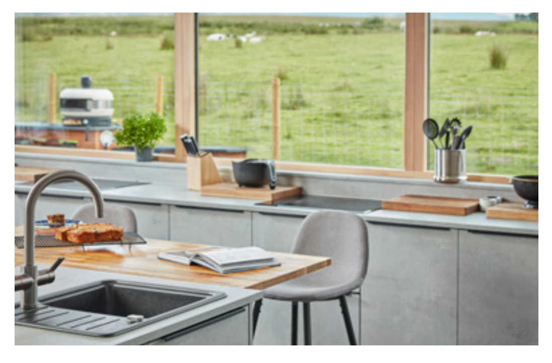
Above top Korlok | Volcanic Black RKT2406