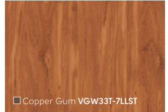
□ Copper Gum VGW33T-7LLST