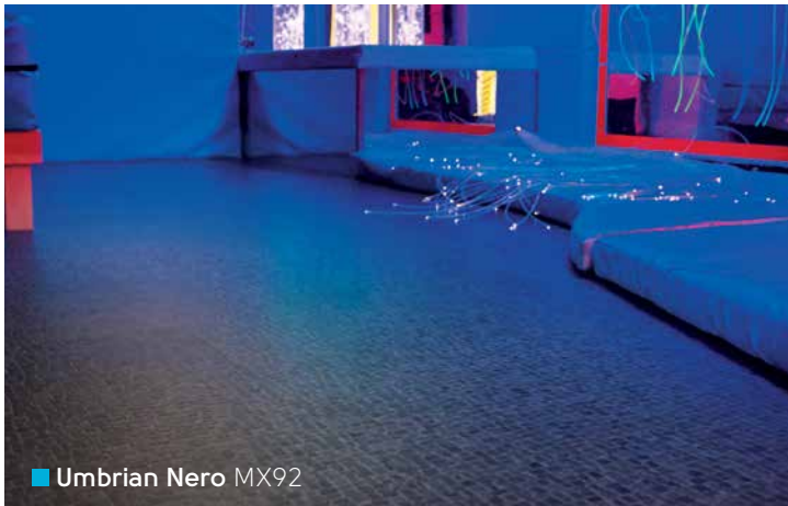
■ Umbrian Nero MX92