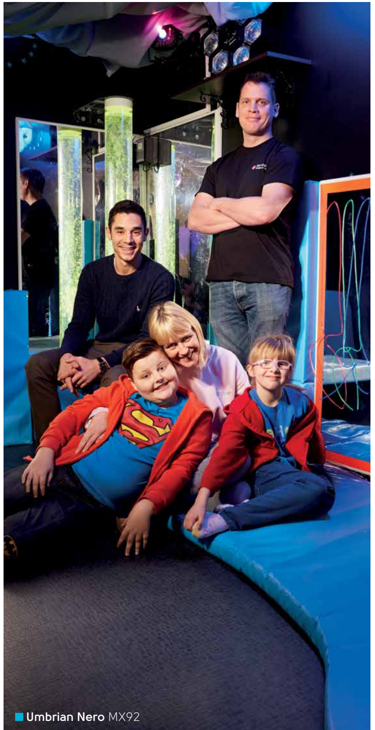
■ Umbrian Nero MX92

An Evesham charity specialising in respite care for children with disabilities has been able to add the perfect finishing touch to its new multi-sensory room.