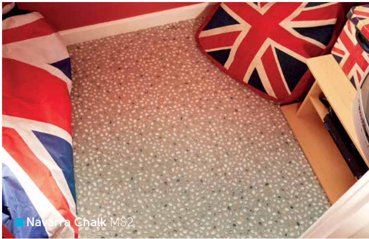
■ Navarra Chalk MS2